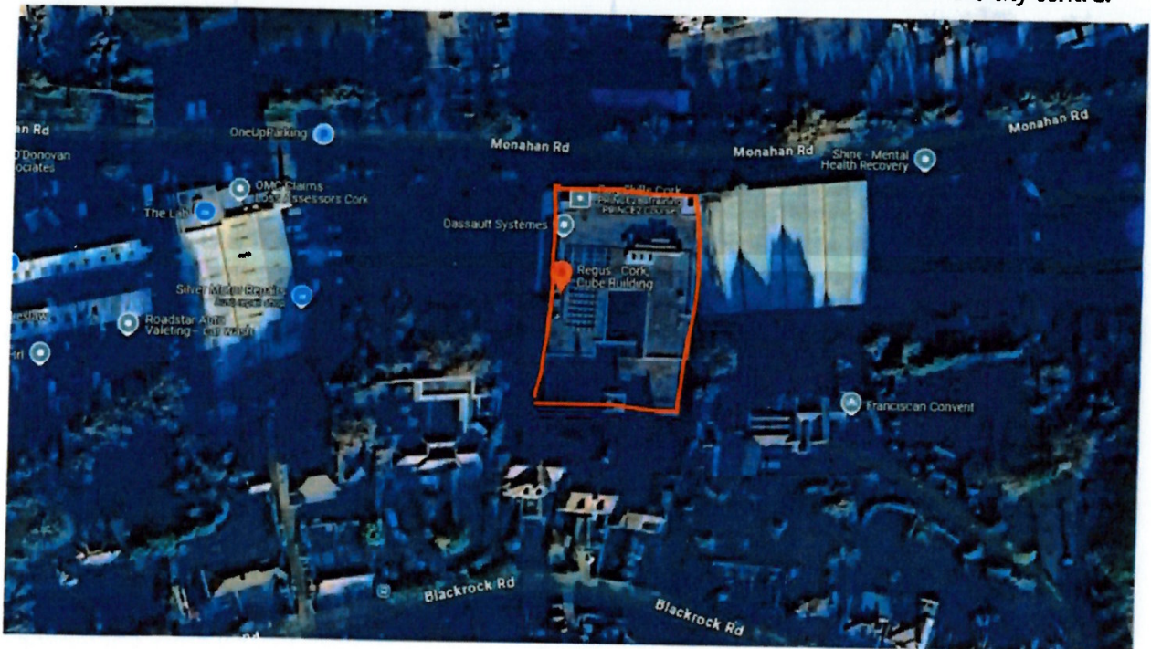
Figure 1 – site marked in red

The Cube Building is located on Monahan Road in Ballintemple, on the eastern edge of Cork city centre. The building is positioned on the south side of the road and sits adjacent to the roadside between two industrial sites, one of which has a road level car park. The site is 1.4 kilometres from the city centre.